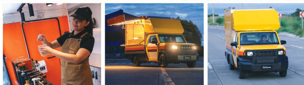
Images shown are prototypes only. Final product may vary.