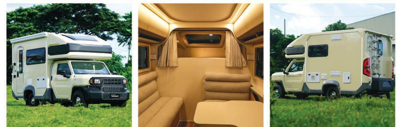
Images shown are prototypes only. Final product may vary.