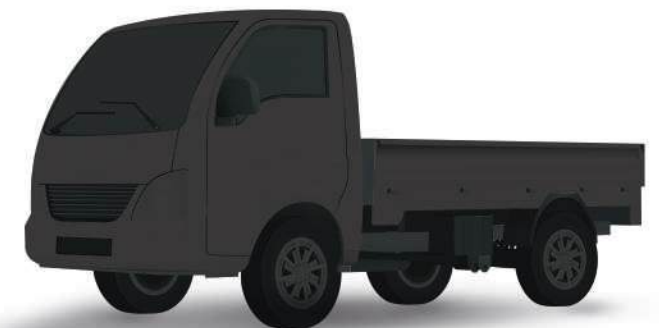
Other Cabover Dropside

Image shown is prototype only. Final product may vary.