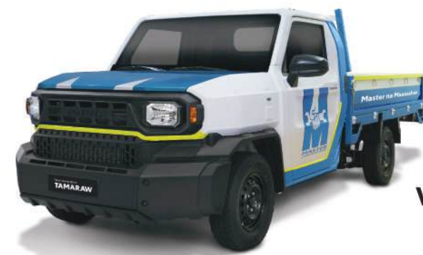
Conventional (Bonnet) Dropside

✓ Mas maraming pwedeng i-customize sa loob ng sasakyan —mas madaling ma-meet ang mga kailangan mo para maging panalo sa buhay!