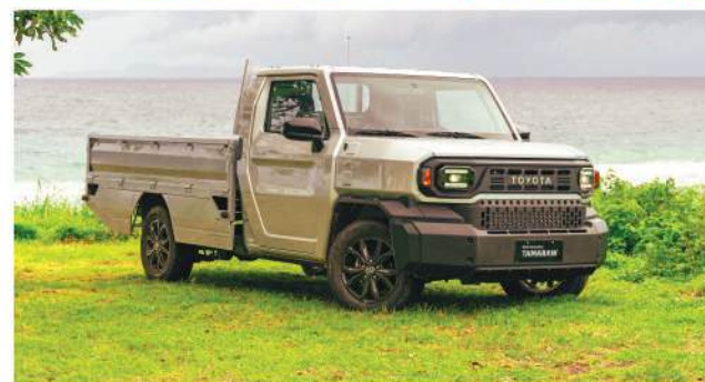
Images shown are prototypes only. Final product may vary.